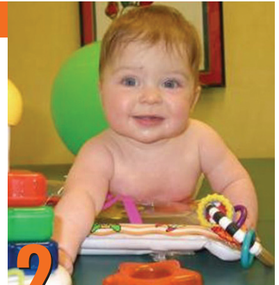
2 Positions for Play