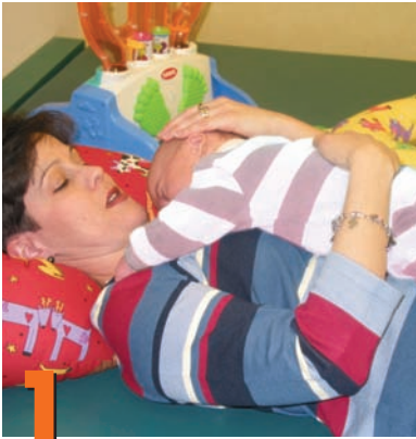
1 Positions for Play