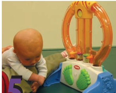
5 More Activities