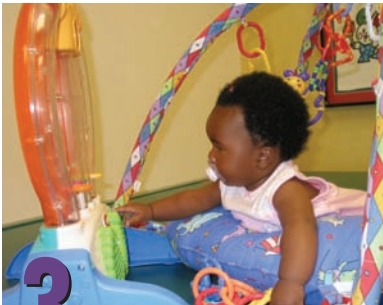
3 More Activities