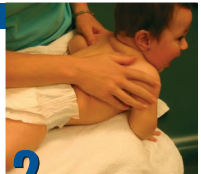
2 Dressing and Bathing