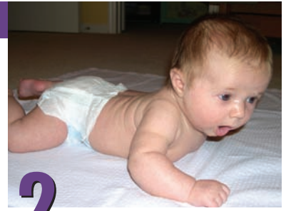
2 More Activities