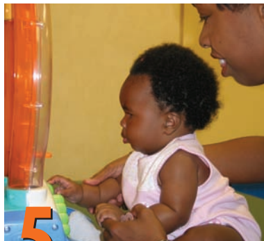
5 Positions for Play