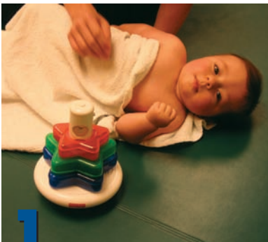
1 Dressing and Bathing