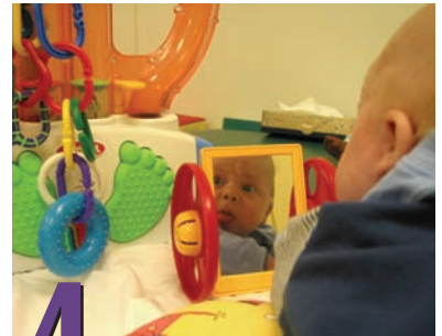
4 More Activities