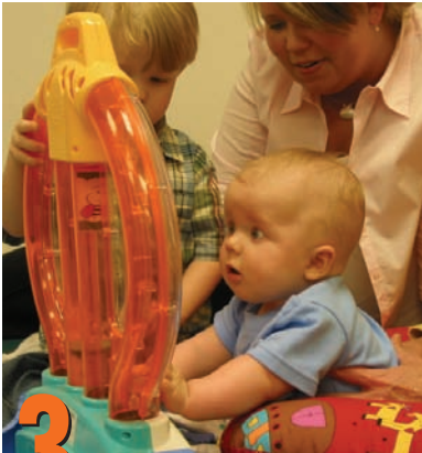
3 Positions for Play