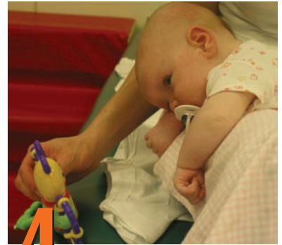
4 Positions for Play